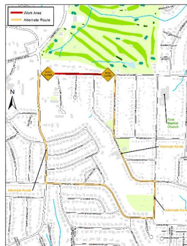
Country Club Road Detour