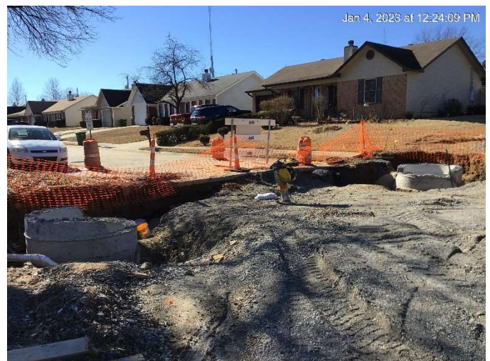
Drainage installed, compacting fill. Maryland Place.