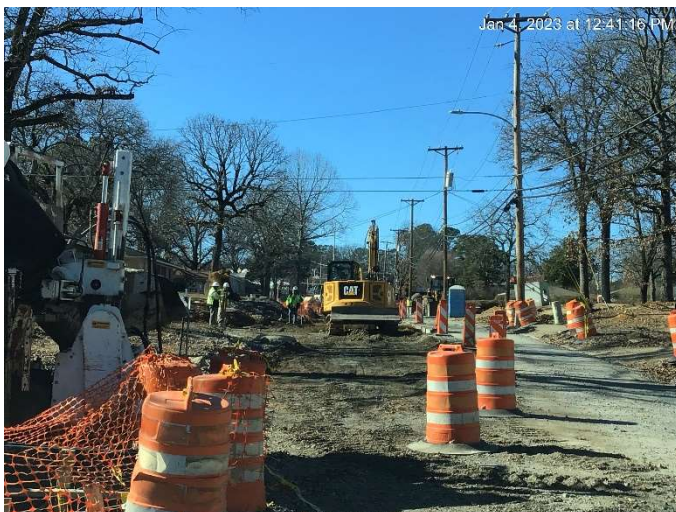
Removal of existing concrete street