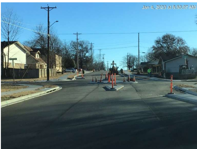
Traffic Circle @ Barber Street / Spring Grove Drive.

Gene Summers Construction crews have completed the required work at the intersection of E Maryland Avenue, Barber Street and Spring Grove Drive. Crews are shoring up the base preparing for a roll test. String line has been placed for the curb and gutter machine.