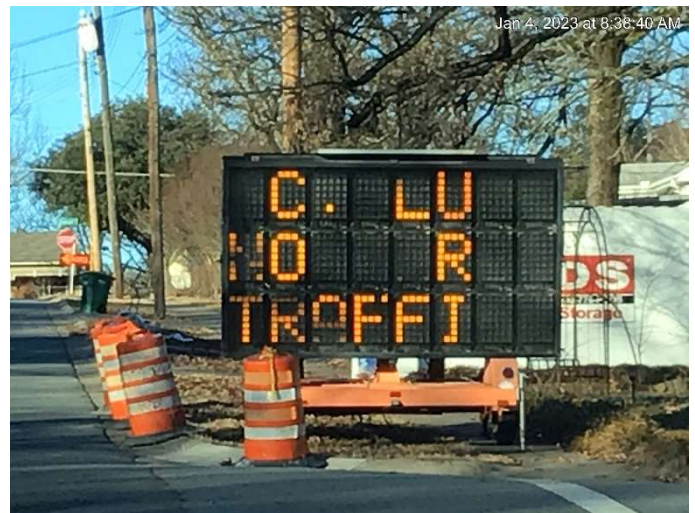
C. CLUB NO THRU TRAFFIC (bad picture)