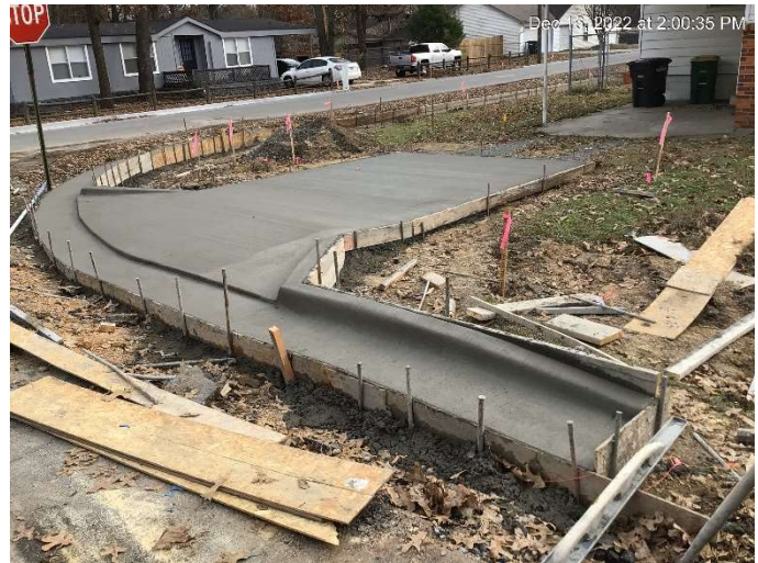
NEW Driveway Apron off May Avenue