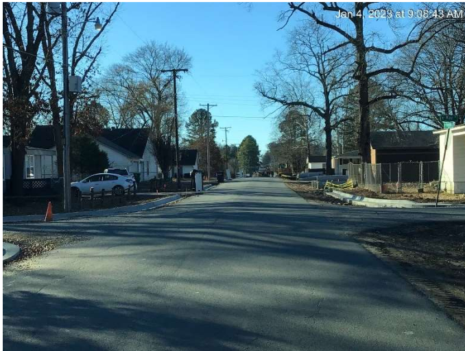
2-14' of Travel Lanes

Hemphill Road is progressing at a steady pace. Storm drain piping has been installed from Shorthill north. Curb and gutter have been completed to from Ridgelea Avenue around Cherrie Avenue and across the bridge. This will provide for two 14' Travel Lanes with curb and gutter. Redstone will deploy a milling machine in the coming days to remove the existing asphalt. The round-a-bout designed at Hemphill and Maryland has been cancelled and design work is underway for a more traditional "T" intersection. Due to utility relocation delays, this project is running behind schedule.