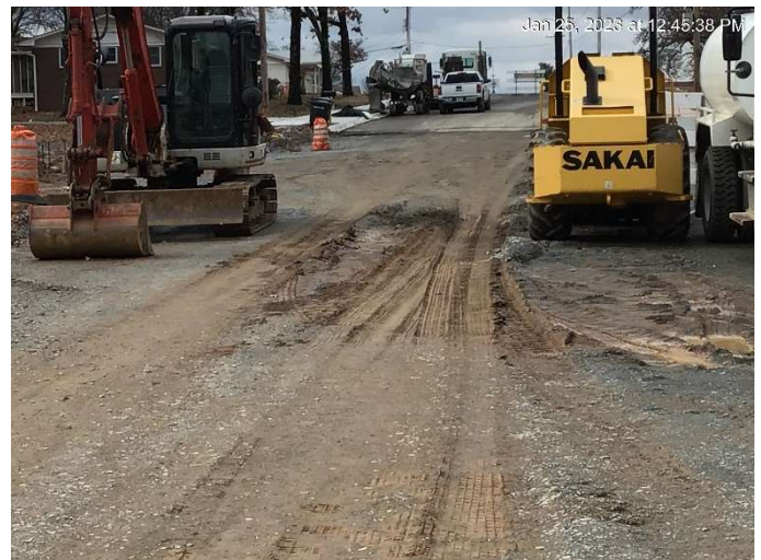
NOT passing a roll test.