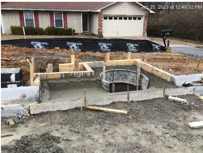
Stormwater Inlet box.

Gene Summers Construction has poured curb/gutter on the north side of Maryland from approximately Pamela Lane to Robin Lane. Stormwater inlet boxes and throats are being formed and poured weather permitting. Crews continue to work the area in preparation for roll tests, if the subgrade is spongy or ruts, you will not pass a roll test.