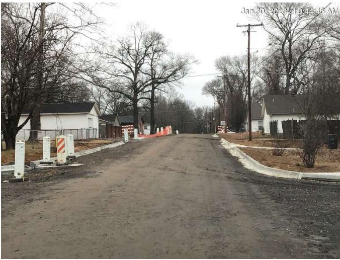
2-14' of Travel Lanes