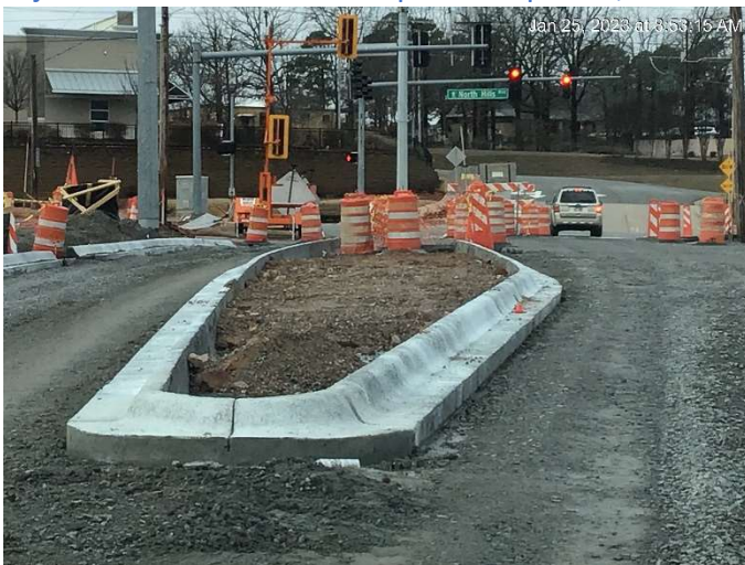
Island County Club & North Hills

This project is ON TIME for completion April 21, 2023.