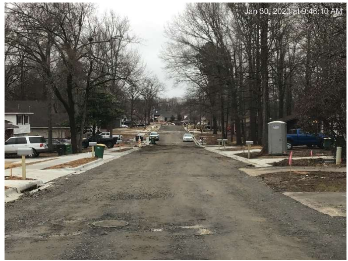
Hemphill Road toward Maryland